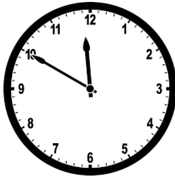
eleven fifty; ten til twelve