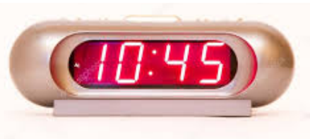
ten forty-five; quarter til eleven