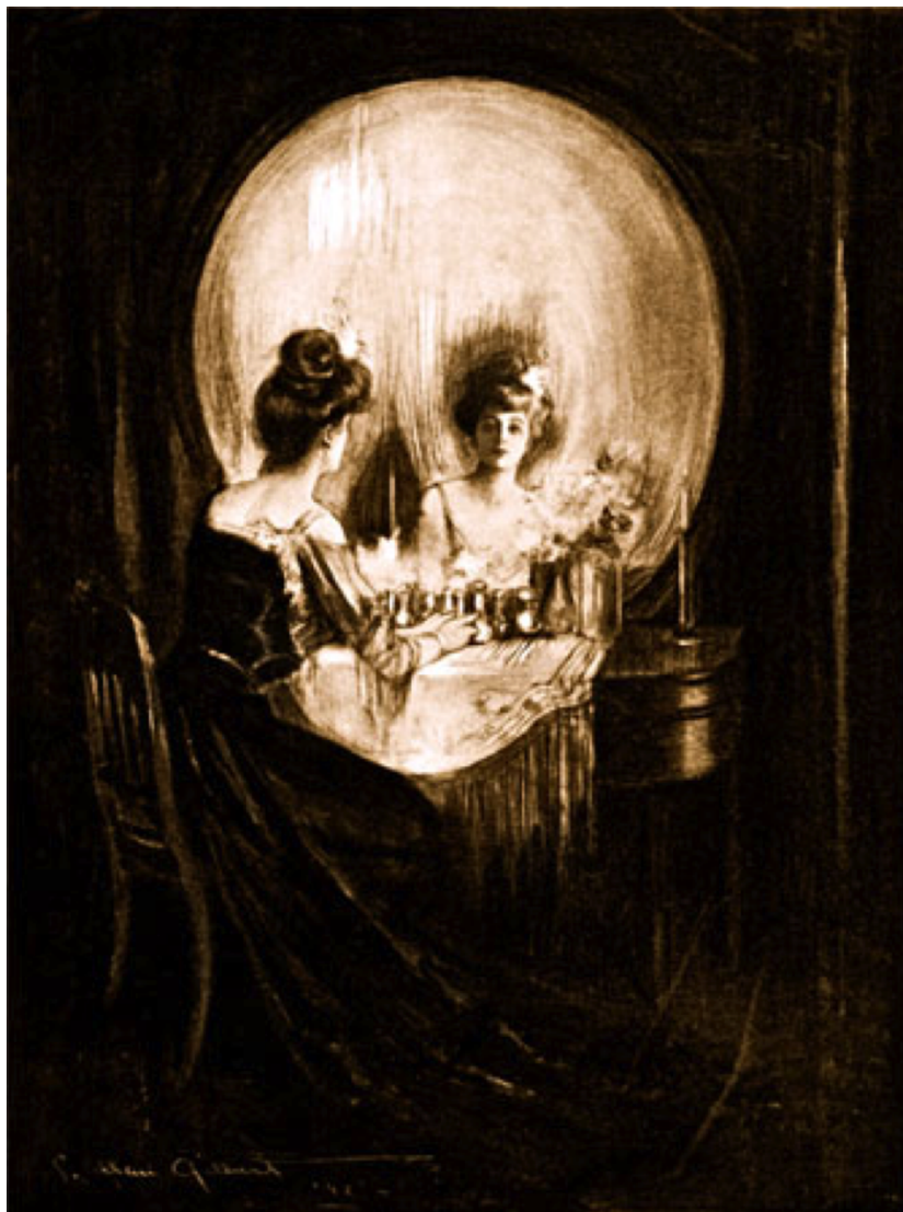
[skull or woman gazing in a mirror]