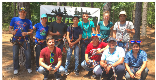
Students and MEP staff from Bladen County celebrate completing the ropes course.